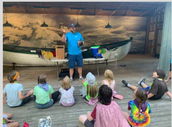
Animals on Summer Solstice with the Outdoor Discovery Center