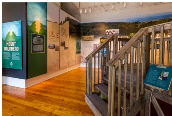
Gallery with the Mount Baldhead observation tower and view of exhibit.