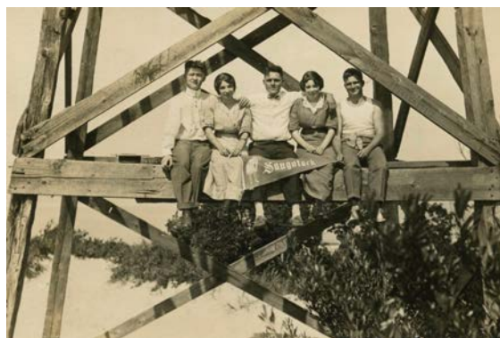
Historic postcard image of the observation tower atop Mount Baldhead.