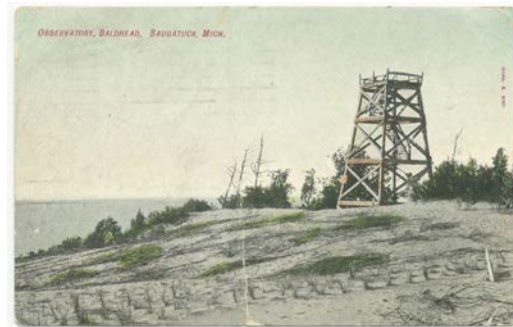
Historic postcard image of the observation tower atop Mount Baldhead.