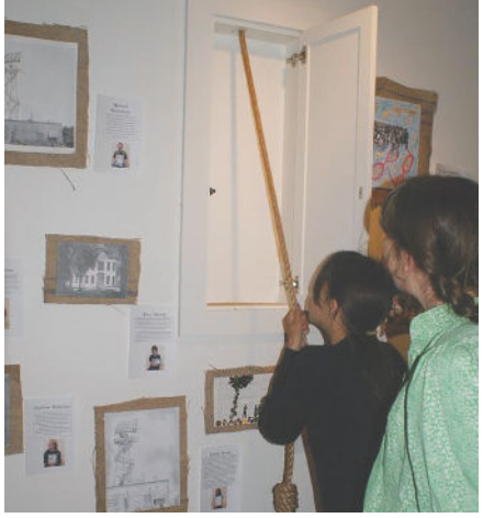
The Old School House today includes six city lots of woods and gardens