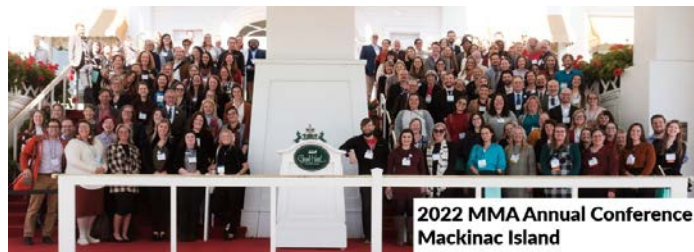
2022 MMA Annual Conference Mackinac Island

This was the first in-person MMA conference in three years. The annual conference, which moves to a new location each year, has returned to Mackinac on the 50th anniversary of the first MMA conference, which was also held on Mackinac Island. The goal of every MMA conference is to bring the Michigan museum community together around professional development goals to elevate the museum community and cultivate vibrant communities. Over 150 attendees from museum of all types and sizes and from throughout the state of Michigan attended.