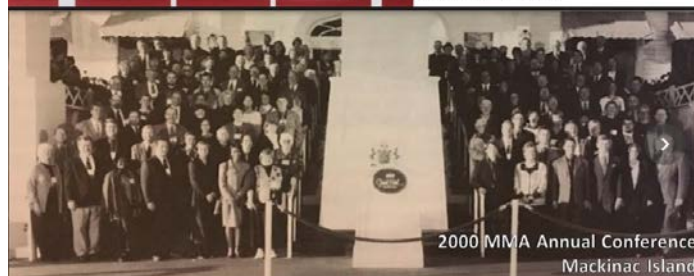
2000 MMA Annual Conference Mackinac Island